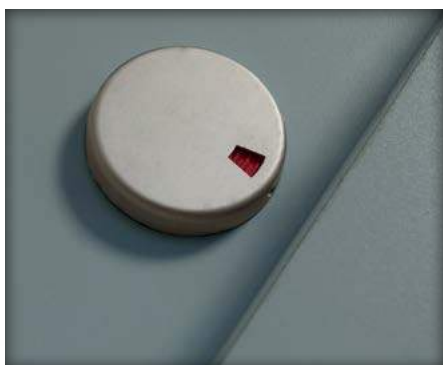
Cubicle doors come with an aluminium indicator bolt providing security and pleasing aesthetics