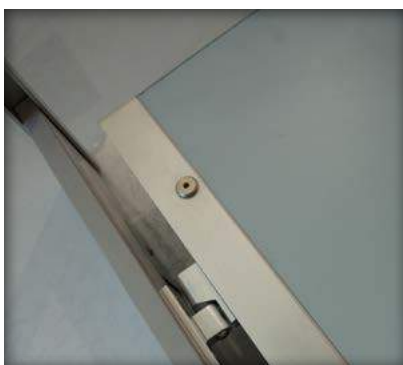
quickCUBE comes with a full-height door hinge to allow door width to be trimmed