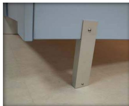
Cubicle legs are set-back and fixed to the partition, whilst providing a solid fixing to the floor

Quick to Order, Quick Delivery & Quick to Assemble